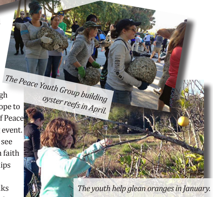
The Peace Youth Group building oyster reefs in April.