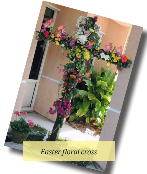
Easter floral cross