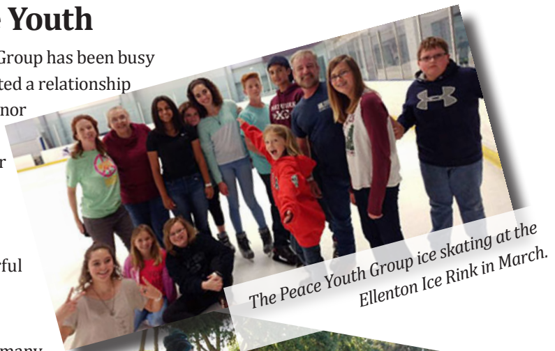
The Peace Youth Group ice skating at the Ellenton Ice Rink in March.