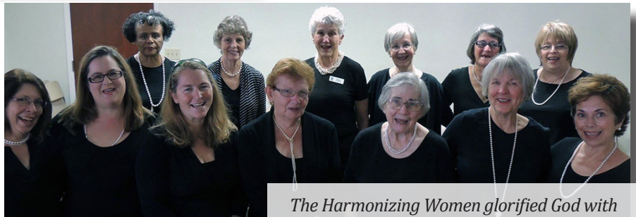
The Harmonizing Women glorified God with their voices in February.