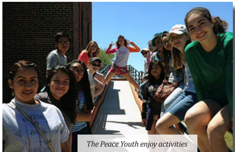
The Peace Youth enjoy activities with the Beth-El youth.