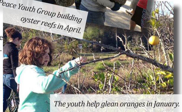
The youth help glean oranges in January.

in Montreat, NC for High School students. We hope to have a great turnout of Peace youth at this inspiring event. It is a truly blessing to see them grow stronger in faith and in their relationships with each other. The generosity of Peace folks