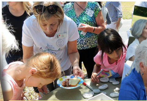
Palm Sunday Groundbreaking for our new Sanctuary and picnic celebration