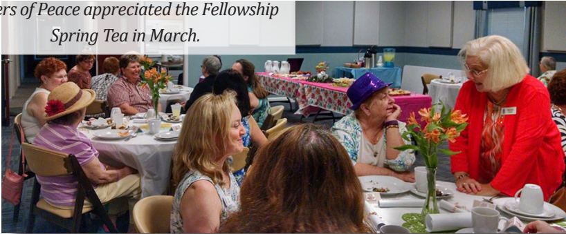
Sisters of Peace appreciated the Fellowship Spring Tea in March.