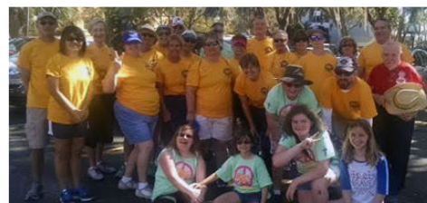
Representatives of Peace at the CROP Walk

On February 26, several Manatee County churches, comprising 228 walkers, participated in this annual event by