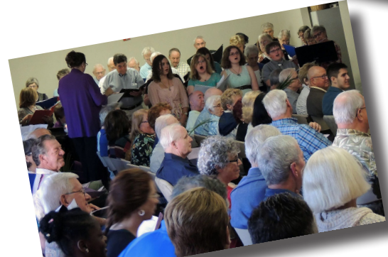
Palm Sunday services

Now on the first day of the week Mary Magdalene came to the tomb early, while it was still dark, and saw that the stone had been taken away from the tomb. So she ran and went to Simon Peter and the other disciple, the one whom Jesus loved, and said to them, "They have taken the Lord out of the tomb, and we do not know where they have laid him."