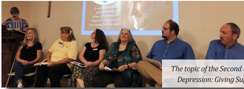
The topic of the Second Peace Forum was Depression: Giving Support and Hope.