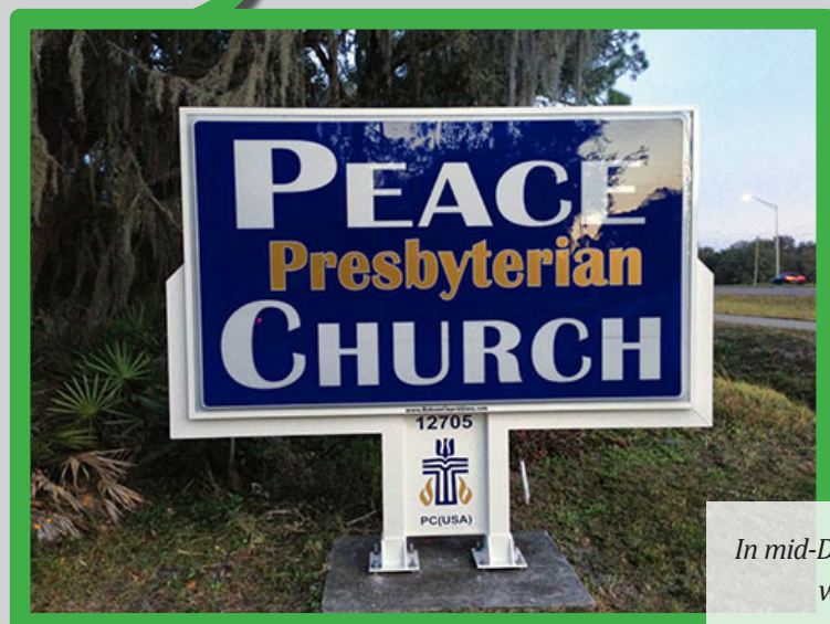
In mid-December the new sign for our church was installed on State Road 64.

We now have cleaning and pest services hired. One important addition is blue recycling bins in most of the rooms. Please use them, to help our environment!