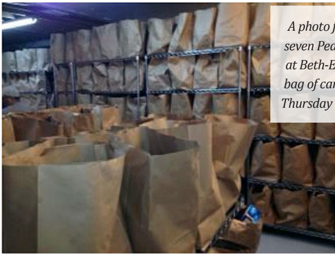
"We celebrate the gratitude of Peace for the seven Peace Baggers who prepared 400 bags of groceries this morning at Beth-El. Tomorrow the farm worker families will receive a generous bag of canned food, plus a ham, a chicken and some fresh bread." Every Thursday 5 to 15 people from Peace bag up food as a mission to Beth-El.