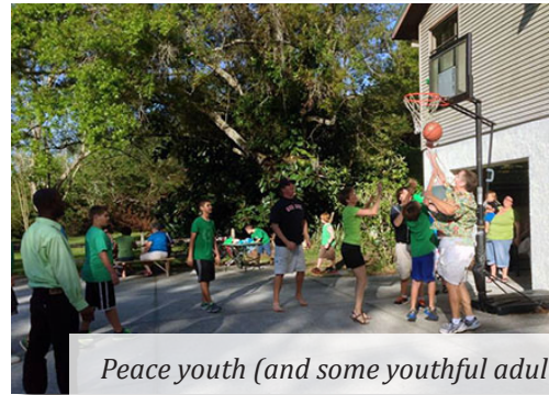
Peace youth (and some youthful adults) playing basketball at the St. Patrick's party.