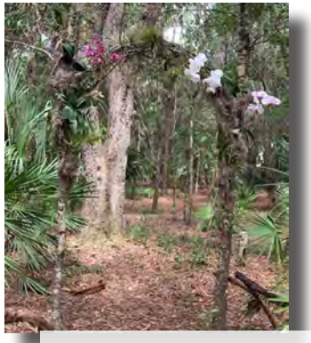
The Orchid Archway on the Peaceful Path

Saturday, October 23: Peace Presbyterian's Pumpkin Patch from 12-6 p.m. Enjoy two Spooktacular organ concerts, the pumpkin patch, and a Not-So-Haunted Path